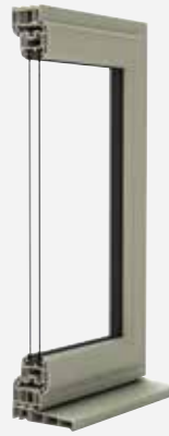
French Casement Window