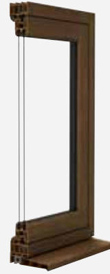
French Flush Casement Window