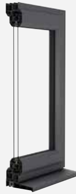
French Casement Window